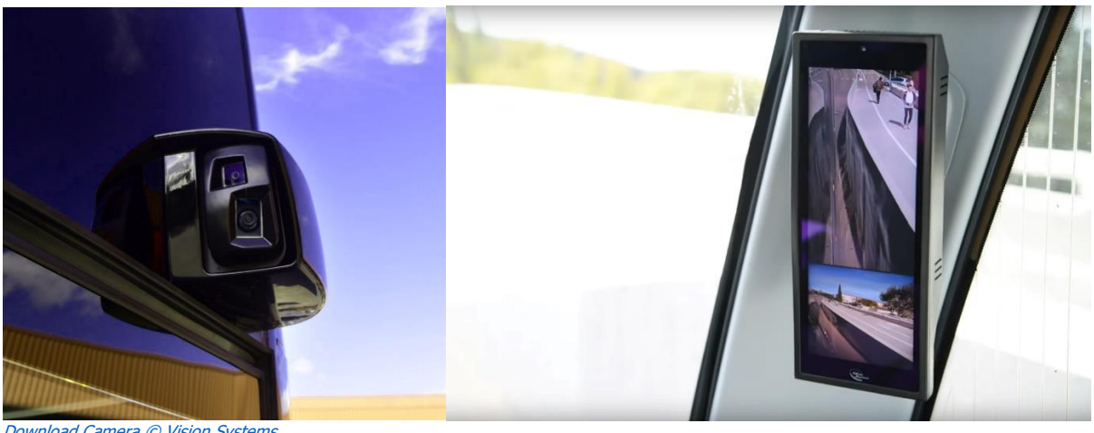
Download Camera © Vision Systems Download Display © Vision Systems Watch Smart-Vision video!